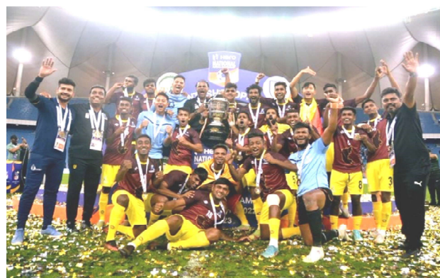
Santosh Trophy after five decades.

Not even the staunchest supporters of Karnataka could perhaps ever imagine that the state team would have to travel more than 3,000 kilometres from Bengaluru to bring back the