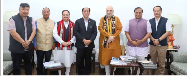
Agency Kohima, Mar 6:

Ahead of the swearing-in ceremony of the new government to be held on Tuesday in the presence of Prime Minister Narendra Modi in Kohima, Assam Chief Minister Himanta Biswa Sarma and outgoing Chief Minister of Nagaland Neiphiu Rio met Union Home Minister Amit Shah and Bharatiya Janata Party (BJP) national president JP Nadda in New Delhi.