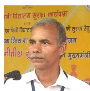
By: Er. Prabhat Kishore

For advertisement kindly contact: - 0385-3590330 (O). For time being readers can reach the office at Cell Phone No. 9862860745 for any purpose.