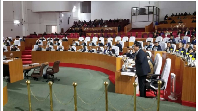
Agency Shillong, Mar 6:

The newly-elected members of the Meghalaya Legislative Assembly took their oath of affirmation during a special session at the Assembly in Shillong on Monday.