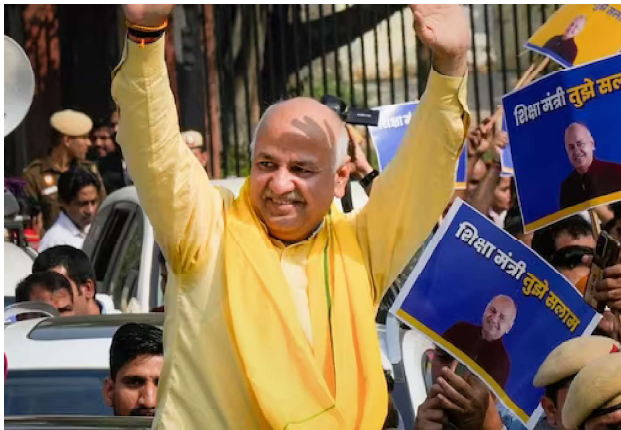
Agency New Delhi, Mar 6:

Former Delhi Deputy Chief Minister Manish Sisodia, who was sent to CBI custody while being produced in court on Monday following his arrest in the Delhi excise policy case.